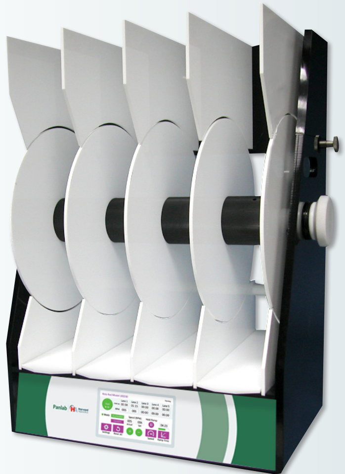
The NEW model LE8305