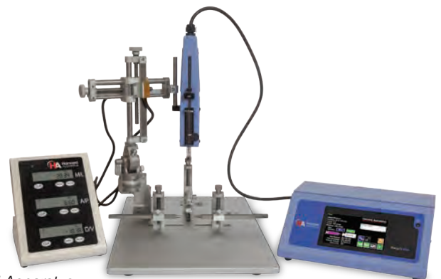
Harvard Apparatus Digital Stereotaxic Frame