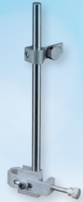
Large Probe Holder